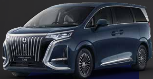
Whale Sea Blue

Take your pick from four stunning shades inspired by nature's magnificence.