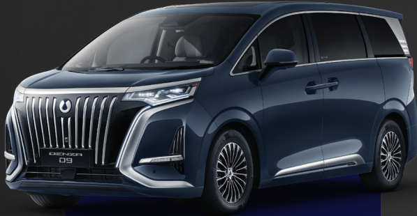
Whale Sea Blue

Take your pick from four stunning shades inspired by nature's magnificence.