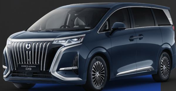
Whale Sea Blue

Take your pick from four stunning shades inspired by nature's magnificence.